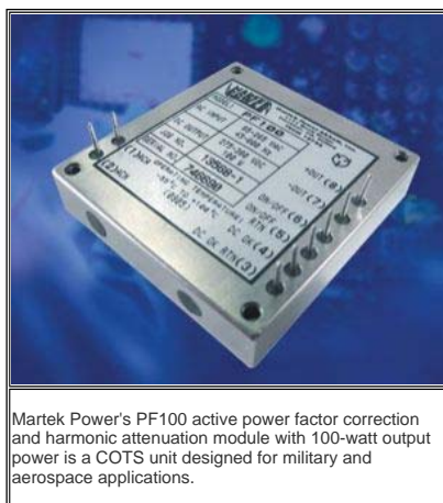
Martek Power's PF100 active power factor correction and harmonic attenuation module with 100-watt output power is a COTS unit designed for military and aerospace applications.

At the same time, power supplies will need to be lighter and more compact, Hajduk explains. "To meet these critical requirements, TWTAs in a power-combined configuration must be developed for each frequency band. These TWTs can then be combined with solid-state amplifiers to produce smaller, lighter MPMs."