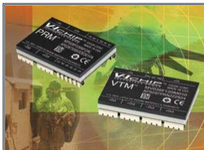
Vicor's V-I Chip, delivering DC-DC conversion and 28-volt DC input in a rugged, miniature package, is well suited to ground vehicle and airborne applications.

BAE Systems engineers designed a system that will more than triple the electric power output of the High Mobility Multipurpose Wheeled Vehicle (HMMWV), and provide exportable power to support such facilities as forward-deployed command centers and field hospitals. It is also capable of providing mobile emergency power during natural disasters. Marine Corps leaders, after evaluating systems from two suppliers, plan to award a contract for five to 10 additional systems later this year.