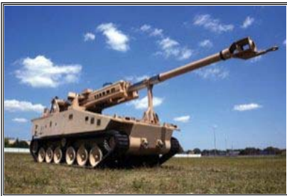
Curtiss-Wright Controls Electronic Systems servo motor controllers were tested in prototype vehicles for the FCS program, particularly the Non-Line-of-Sight Cannon (NLOS-C), shown here.