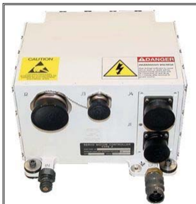
Curtiss-Wright Controls Electronic Systems servo motor controllers serve several functions in combat vehicles, such as to drive the turret and turret positioning, the ammunition handling system, and fans and pumps.

Servo motor controllers are used for several different functions, such as to drive the turret and turret positioning, the ammunition handling system, and fans and pumps throughout the vehicle, as well as to open doors and hatches automatically. "This motor control technology is being leveraged by many post-FCS programs for use in newer vehicles to drive virtually anything that requires a motor," Dolbin adds.