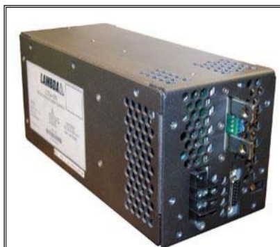
TDK-Lambda's LZSA series AC-DC power supplies are deployed in Tactical Mobile Shelters used by first responders.

Micro Power designs and manufactures custom battery packs for different types of military applications; to date, the company has largely designed battery packs for handheld radios, handheld GPS receivers, and other land warrior applications. Today, however, many mobile applications that have traditionally used lead-acid or flooded lead-acid batteries now use a new type of lithium battery technology.