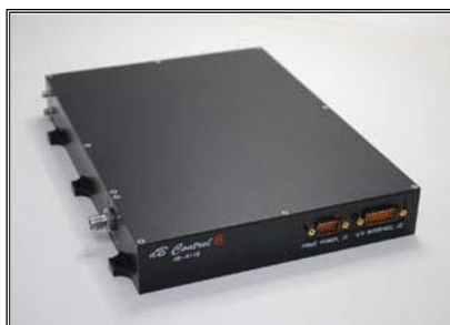
The dB-4118 microwave power module from dB Control is designed for manned and unmanned airborne applications, such as electronic warfare threat simulation, electronic countermeasures, and multi-mode synthetic aperture radars.

Active sonar can detect submarines that are too quiet to be located with passive sonar, and large marine mammals in high sound pressure zones such as those used for military exercises. A Vicor customer, specializing in the rapid prototyping of harsh-environment instrumentation and ocean-acoustic research for diverse commercial and government programs, used Vicor's V-I Chip to develop an enhanced active sonar system for harbor defense.