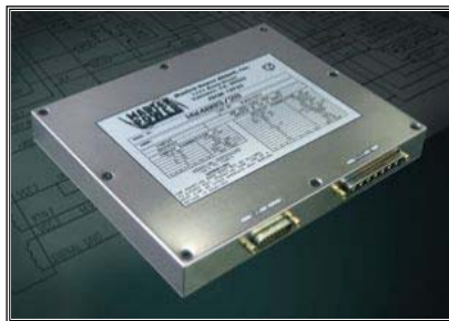
Martek Power's MW400S 400-watt, single-output, AC-DC power module is targeted at military, industrial, and aerospace applications.

Specifically, power amplifiers from dB Control are employed in Lynx SAR/GMTI radar systems, used by many unmanned aerial vehicles (UAVs) to transmit near-real-time, full-motion images of objects on the ground. The system captures images from up to 16 miles above, in total darkness, through clouds and rain.