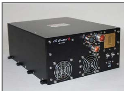
The dB-3758 from dB Control synchronizes the power supply switching frequency with a radar system clock and blanks during the pulse, making it well suited for low phase noise radar transmitter applications.

Other military vehicle applications are increasingly adopting power electronics based on commercial off-the-shelf components. Engineers at TDK-Lambda Americas Inc. in San Diego produce custom power supplies based on COTS power modules for military use. TDK-Lambda has launched a series of power modules that combine AC-DC and DC-DC converters into a one-module solution, enabling a size reduction of 25 percent.